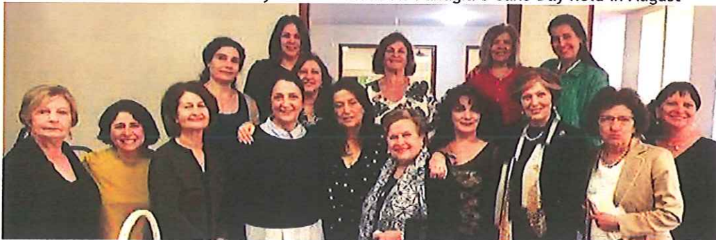
Photo below Ladies Auxiliary at the Annual Tis Panagia's Cake Day held in August