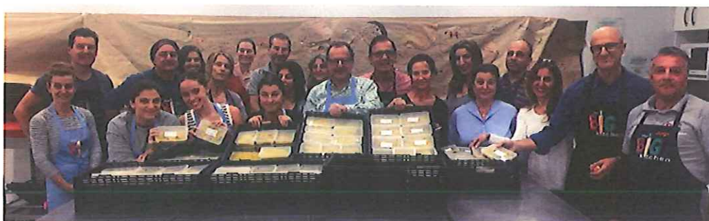
Above St George Hands volunteers at Our Big Kitchen displaying the meals prepared for the homeless