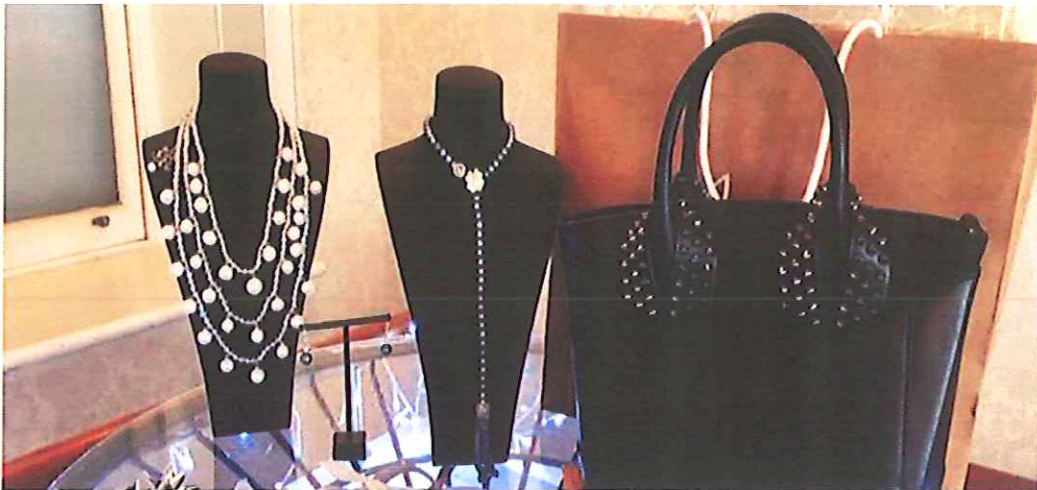
Above some of the beautiful prizes donated at the Dunbar House Function