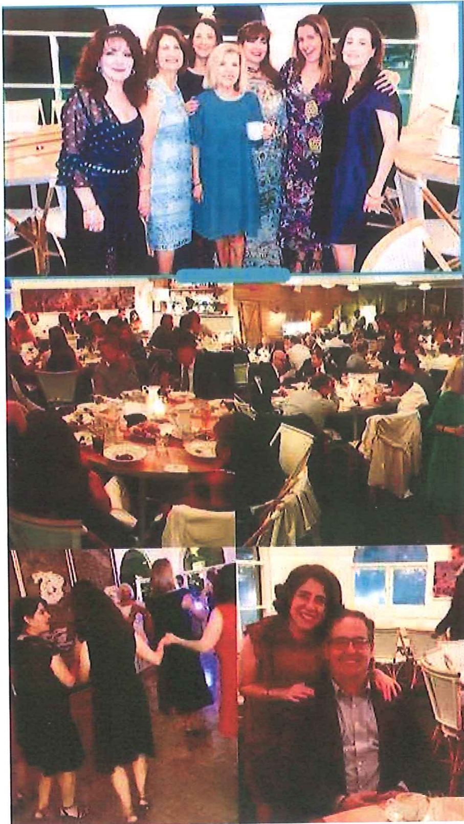
Above photos at the Glendi Night